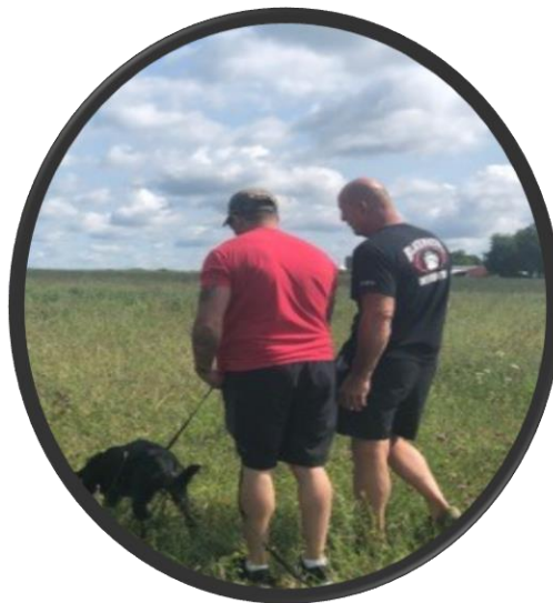
Mental Fitness Coaches