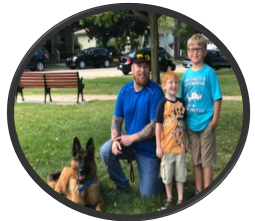
Psychiatric Service Dogs